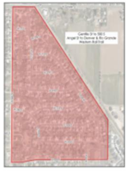
Notification area: Gentile St. to 500 South and Angel St. To Denver & Ric Grande Western Rail Trail.

Since the initial reports, state, county and local officials have actively investigated potential sources, pathways and extent of the vapors.