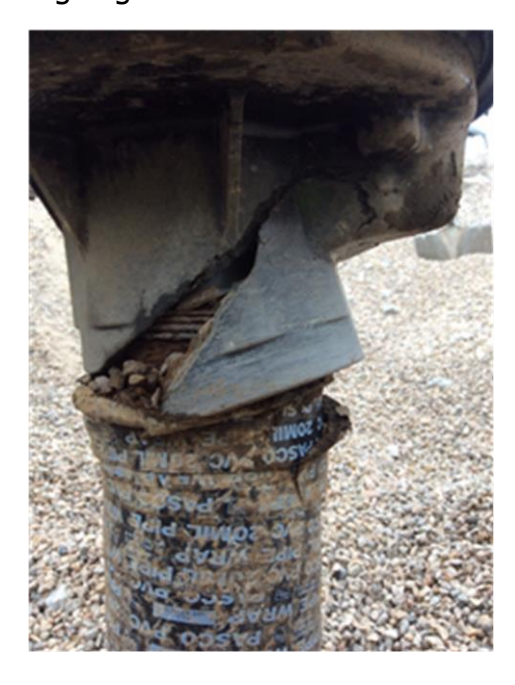
Unleaded Tank's Torn Spill Bucket

Same day replacement of the spill bucket, and a follow up tank tightness test, proved the UST system to now be sound. An inspection of the torn spill bucket and surrounding soils, showed there was minor soil staining in the surrounding backfill, but nothing to suggest a large-scale release. However, further review of UST inventory records suggested product loss from the unleaded tank occurred, and that the release was intermittent and ongoing.